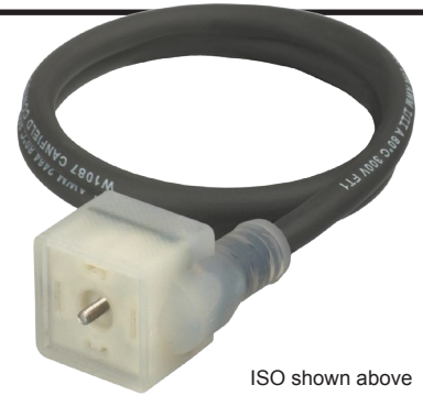
ISO shown above

The Canfield Series 5F all-molded DIN solenoid valve connector/gasket/cord assembly offers a completely molded design that is far better for environmental integrity than field wire versions. Made from rugged yet flexible polyurethane, the connector housing boasts high durability factors and application versatility. The low profile "straight-line" interface/cord configuration allows for installation in many limited space applications. The integrated gasket design boasts an IP67/NEMA 6 rating and makes it impossible to lose the gasket. The 5F and 5J are the only molded valve connectors in the industry that feature a HARD USAGE cord as a standard option in any length required, bi-directional indicator lights, and load suppression (not intended for UL 1449). UL and CSA versions are available as well. Canfield offers any version of the 5F connector with special wires including high flex, media compatible wire, special use wire, high temperature wire on request.